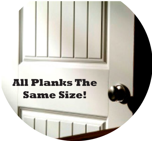
Cashal & Corvado Architecturally Correct Planks