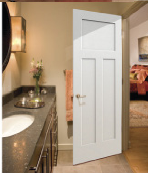
Craftsman-3 Flat Panel Modified Square Sticking Shaker Door