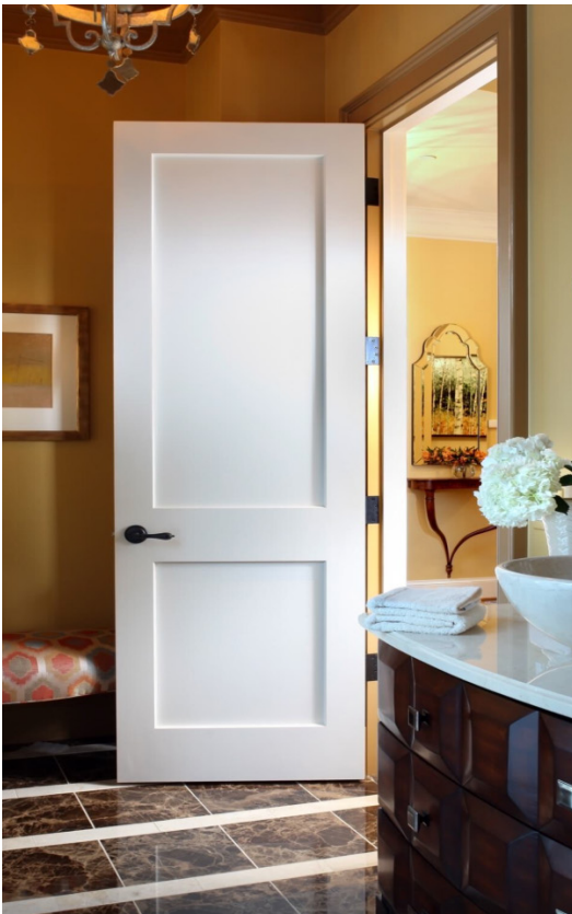
Monroe 2 Flat Panel Modified Square Sticking Shaker Door